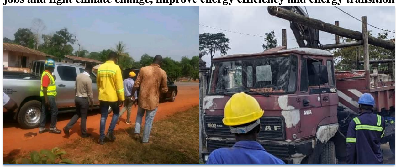
SENEDEV IMPACT REPORT 2024

Our mission is to empower people providing Sustainable Renewable energy, jobs and fight climate change, improve energy efficiency and energy transition